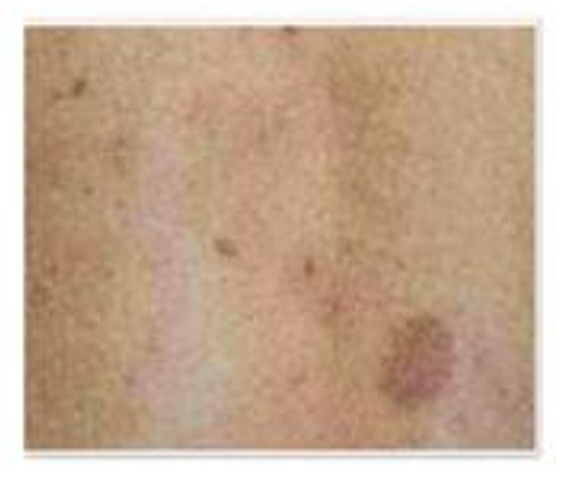
Figure 2: brown spots