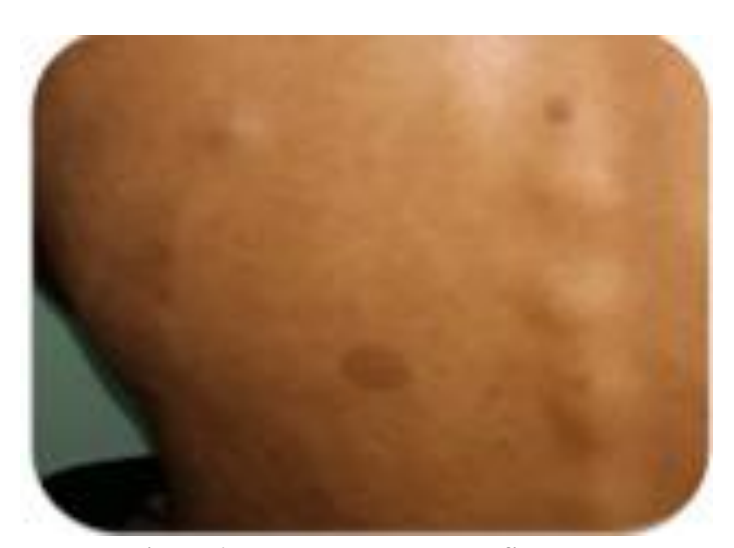
Figure 6: brown spots and neurofibromas