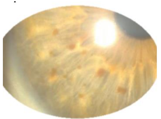
Figure 3: Lish's nodule at the slit lamp

Cutaneomucosal examination revealed several café-au-lait spots with predominantly neurofibromas on the face.